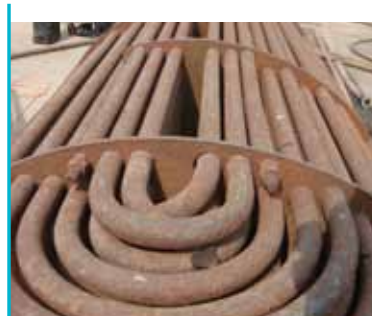
Inspection of any tube shape or material

Dolphin G3™ presents an easy-to-read online report (with drill down options) to the technician for verification, as well as a final summary report including tabular reporting and screenshots of the detected flaws in PDF or HTML format.