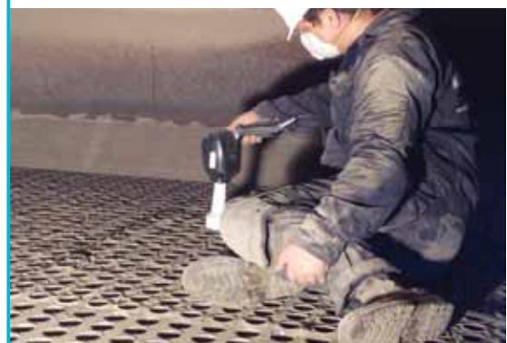
Large diameter tube inspection in industrial boilers