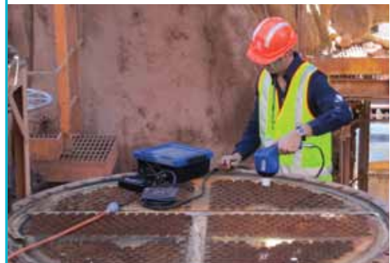
Fast, accurate inspection of heat exchanger tubes